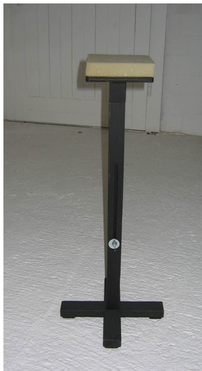
wood support, adjustable in height with foam rubber cushion

Wooden stands used as arm supports for violins and violas must be either built or loaned from the Stockhausen-Verlag :