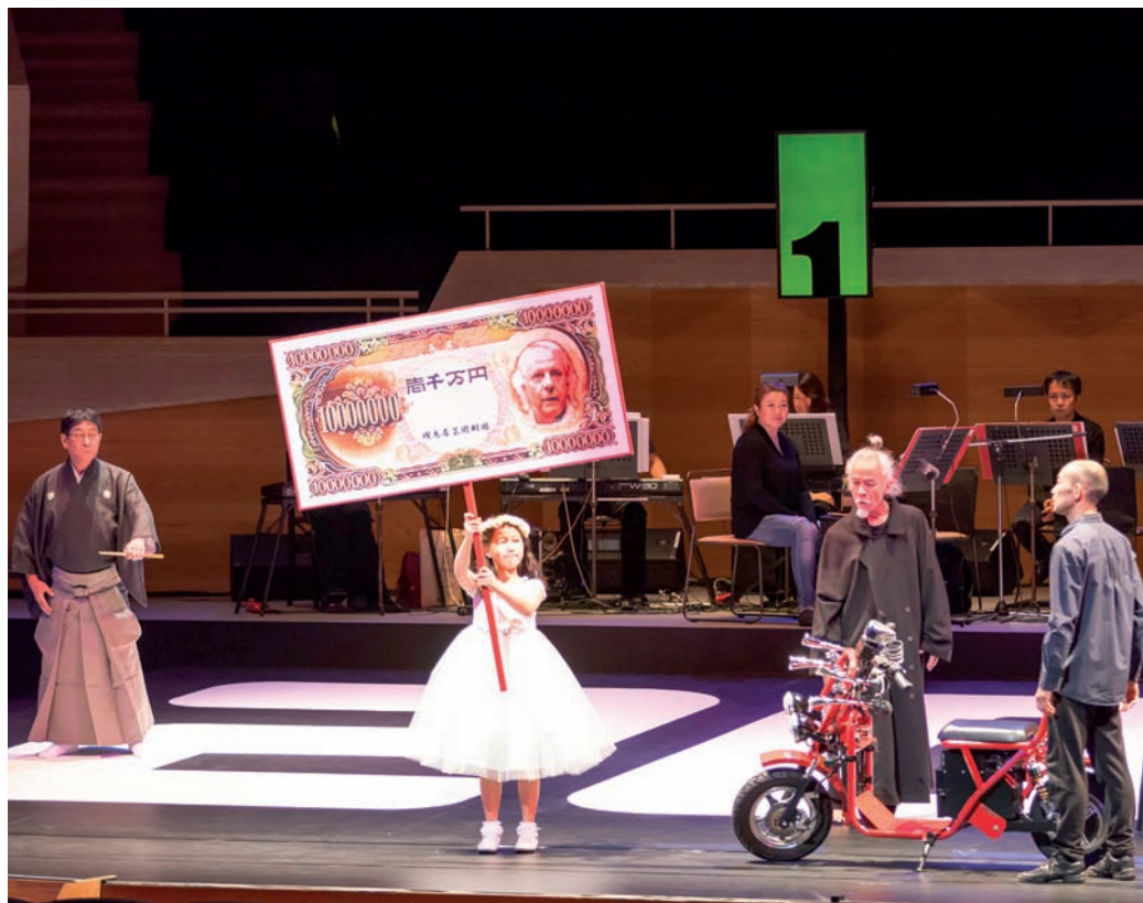
“The angel waves a large bank note” in the performance of COURSE OF THE YEARS in Tokyo on 29 August 2014