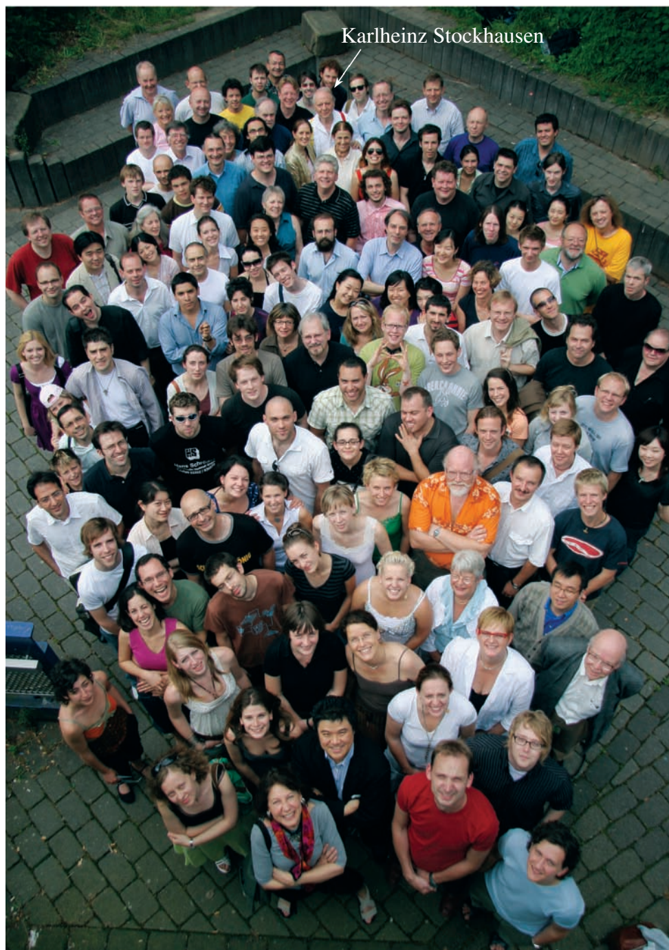
Karlheinz Stockhausen with the participants of the Stockhausen Courses Kürten 2007