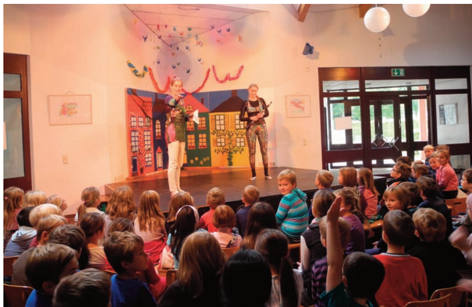
Performance of THE LITTLE HARLEQUIN at the primary school in Kürten