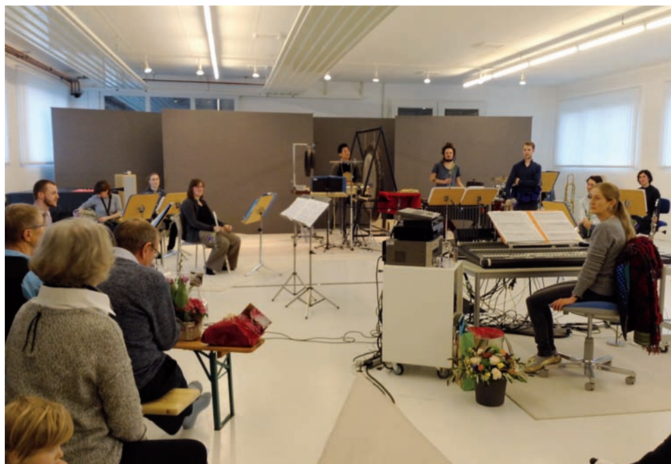
Public rehearsal of the Soloists' Version of MICHAEL's JOURNEY ROUND THE WORLD in the rehearsal hall of the Foundation